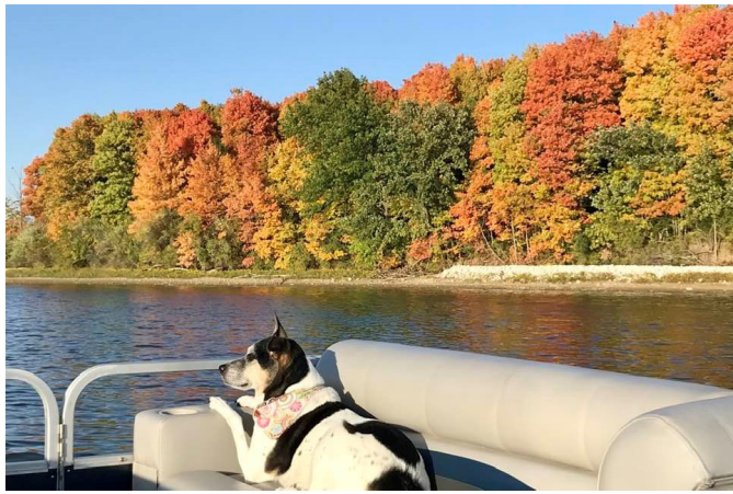
Our dog, Ranger, enjoying fall at the lake!

The LBA Board of Directors will be holding what has become our annual strategic planning session at Timber Pointe Lodge on Saturday, January 21, 2023, beginning at 9:00 AM. At this session, we will discuss the various initiatives and activities undertaken by the LBA in the past year, and ways in which we can continue to improve the quality of life in our lake community for all of our residents. Any LBA member who is interested is welcome to attend.