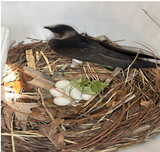
* Purple martin nest

Purple martin landlords or stewards conduct nest checks at least weekly to see what is going on within their martin house. During a nest check, a landlord will lower the house and look inside each of the rooms. This helps catch any issues going on within the house.