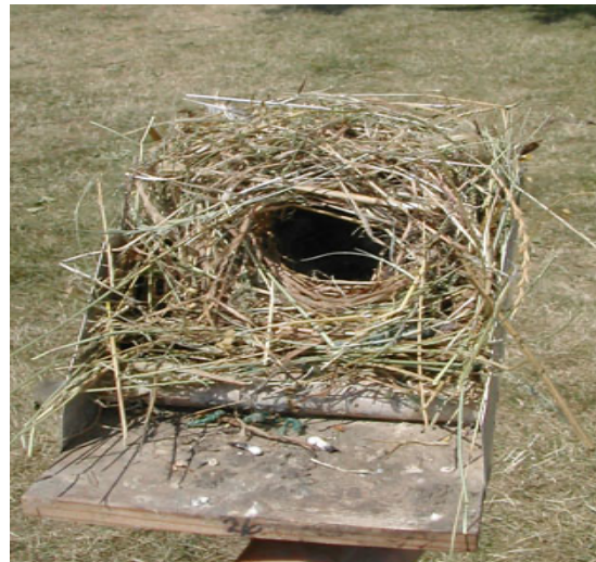
* House sparrow nest

During a nest check, remove any nesting material or eggs from house sparrows to ensure they do not take over the purple martin house. Document when your purple martins begin building nests, the date they begin laying eggs/when they lay their last egg and when the chicks begin to hatch. After the chicks hatch also monitor for any infestations like mites, wasps or spiders that may harm the chicks. Monitor when the eggs begin hatching, to